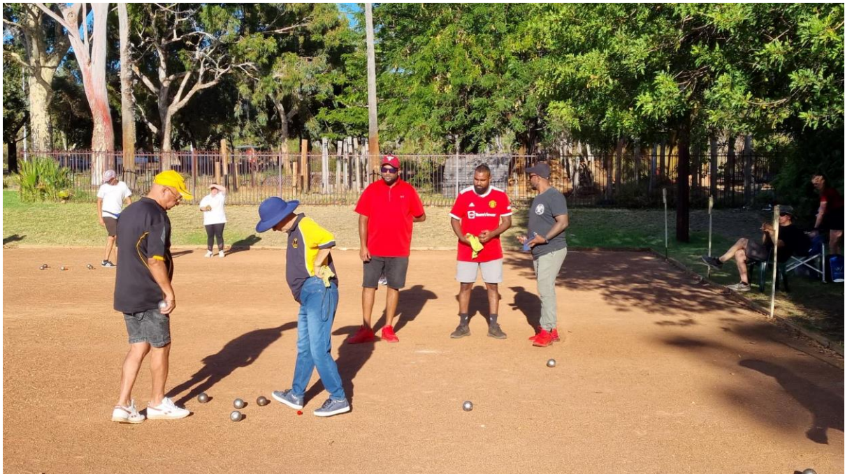
A lovely evening for Pétanque