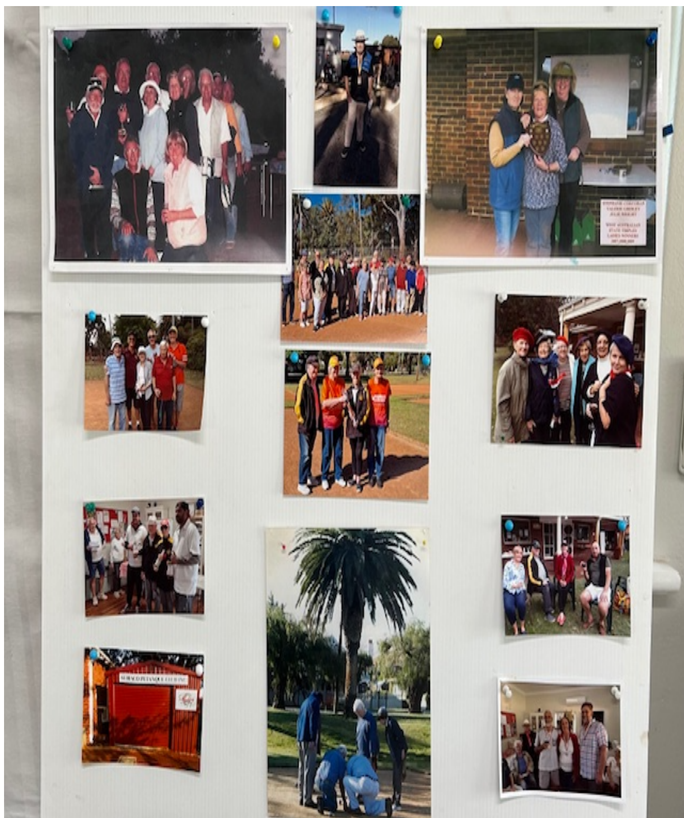
Some wonderful memories. Get your magnifying glasses out.